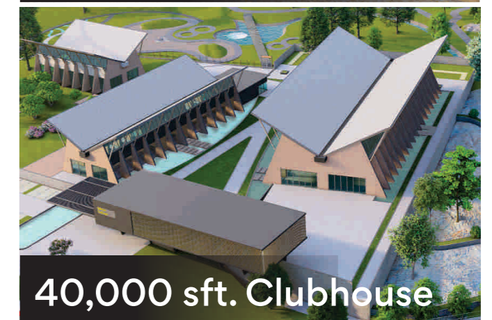
40,000 sft. Clubhouse