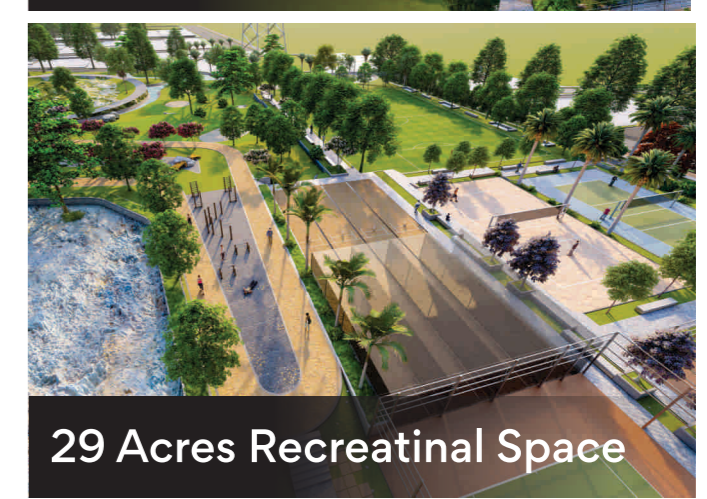
29 Acres Recreational Space